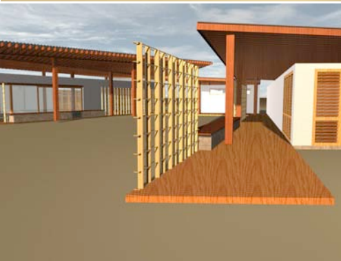
Innovative Community Center (ICC)

Finally, increased eco-tourism is possible with the first facilities in the region serving outside visitors while providing incentives to preserve the local ecology and provide much needed influx of outside money.