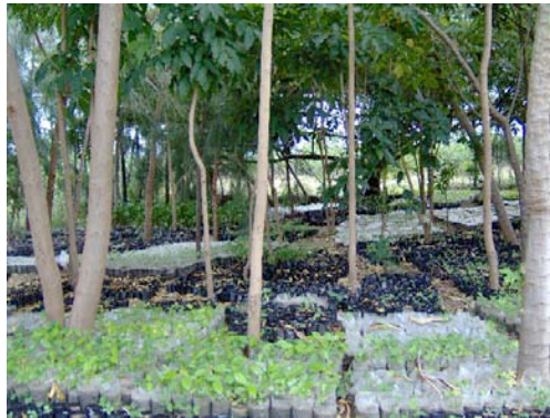
Seedlings ready for planting