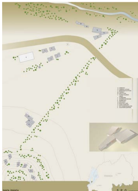
Kageno Rwanda Site Plan

The buildings that serve to gather the people of Banda into a coherent public space include a community center, a library and office facility, and a kitchen and outdoor space. This dynamic assembly serves as the apex of the "V"